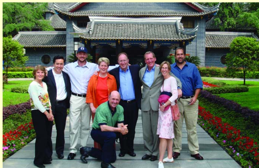
Doctors and friends of the Foundation in Chengdu China.