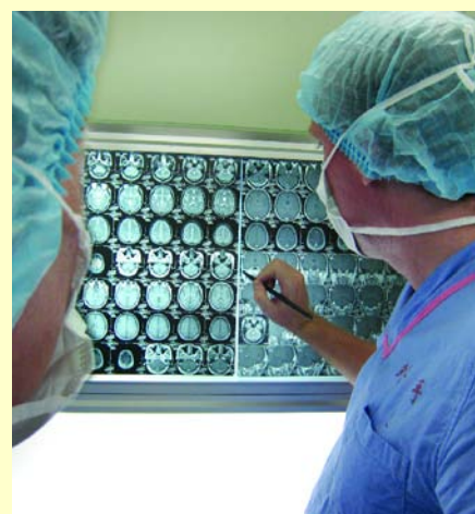
We train before, during, and after surgery.