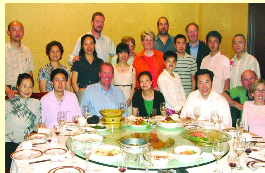
A welcome meal with the ENT leaders at the world's largest hospital.