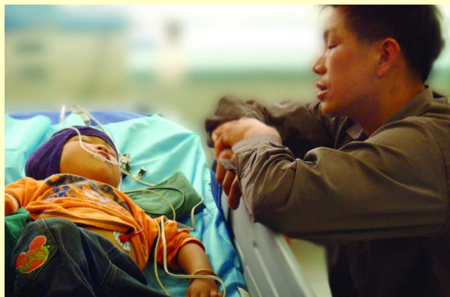
A father watches over his son with hope and anticipation in post op.

group invited to participate in the news conference. Great progress is now being made, and we were issued a new invitation.