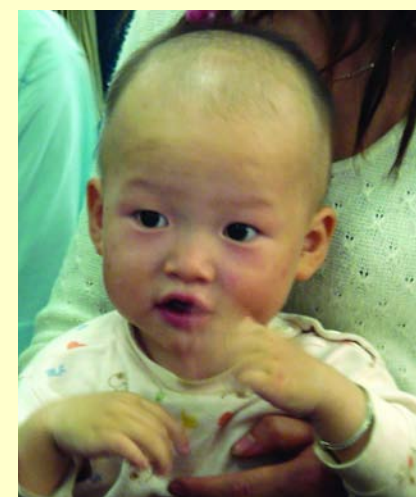
This child now hears as well.