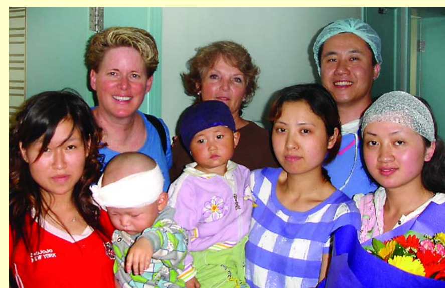
Training doctors while bringing love and hope to many families.