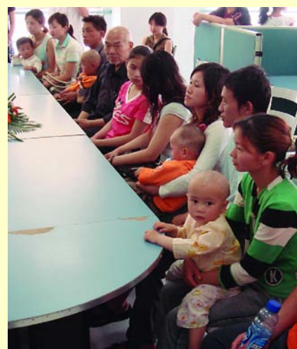
Families preparing for interviews.