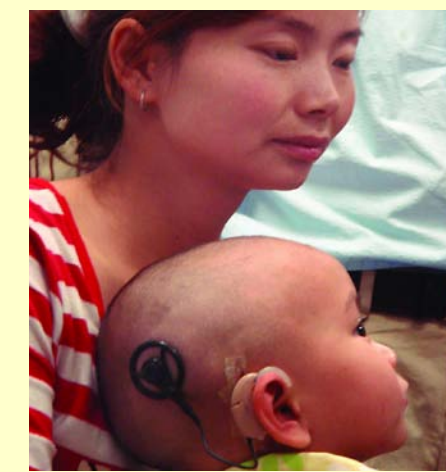
Many tears were shed when this child heard for the first time.